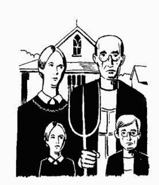
People in Harmony with Nature