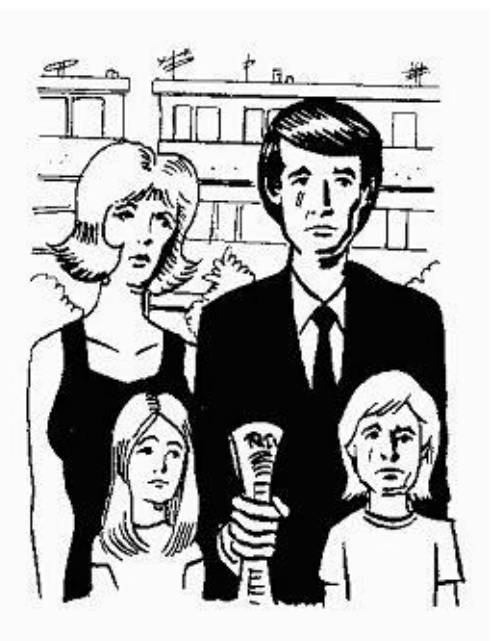
See you in this picture!!!